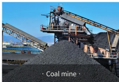
· Coal mine ·