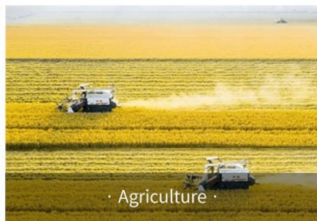
· Agriculture ·