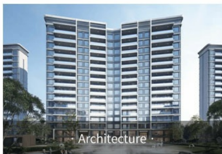
· Architecture ·